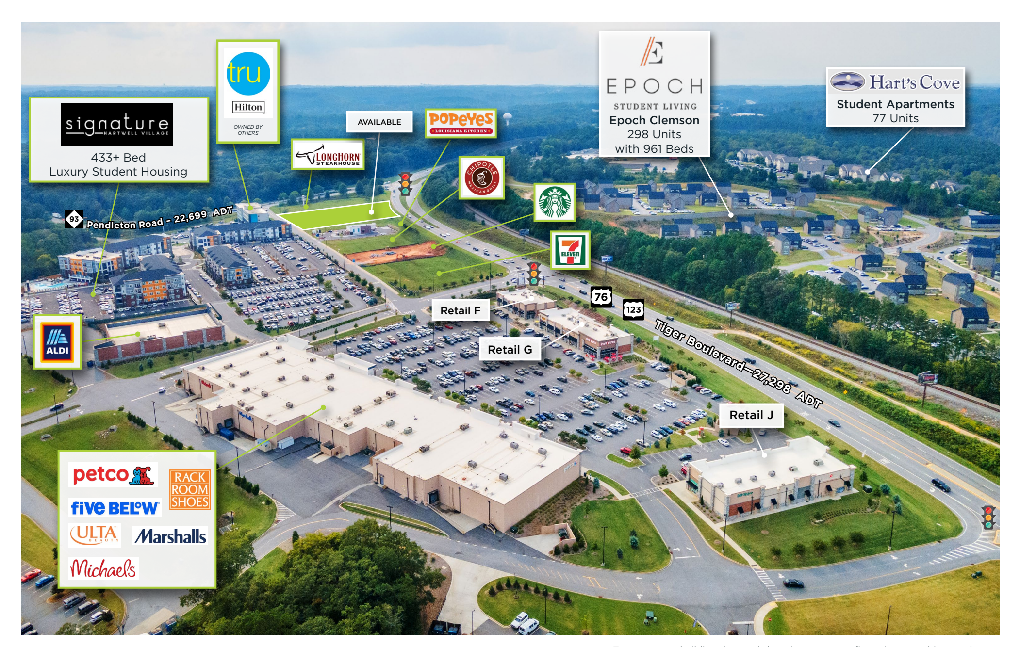
Tenant names, building sizes and shopping center configuration are subject to change.